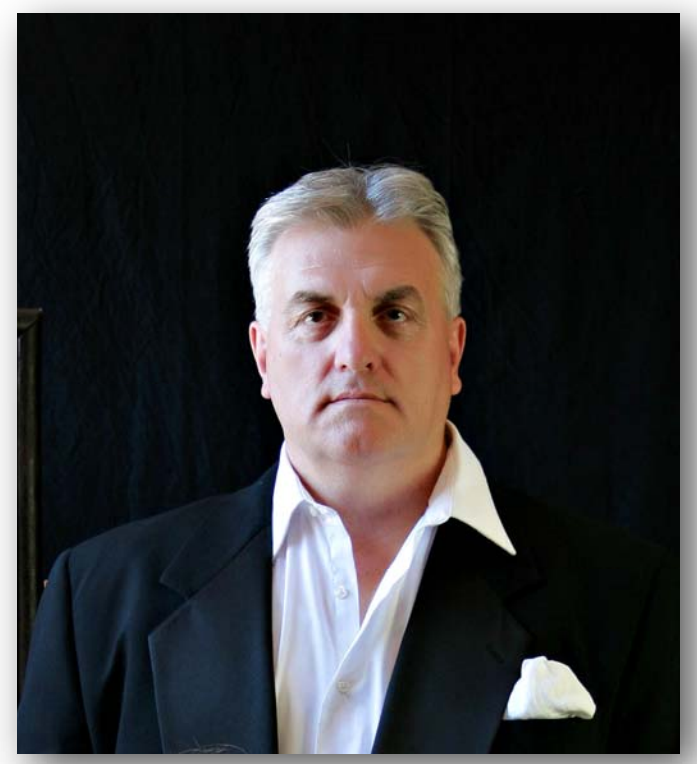
Music First Founder and President